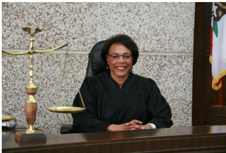
Honorable Winifred Y. Smith January 1, 2014 – December 31, 2015