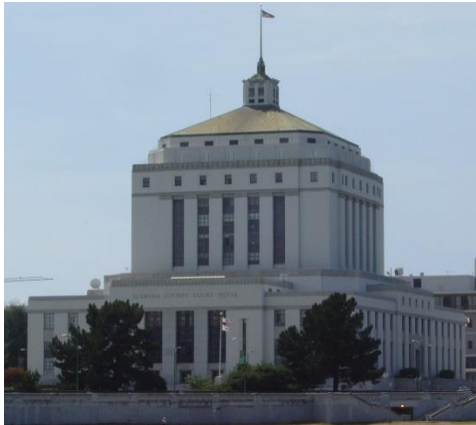
Rene C. Davidson Courthouse, 1225 Fallon Street, Oakland, California